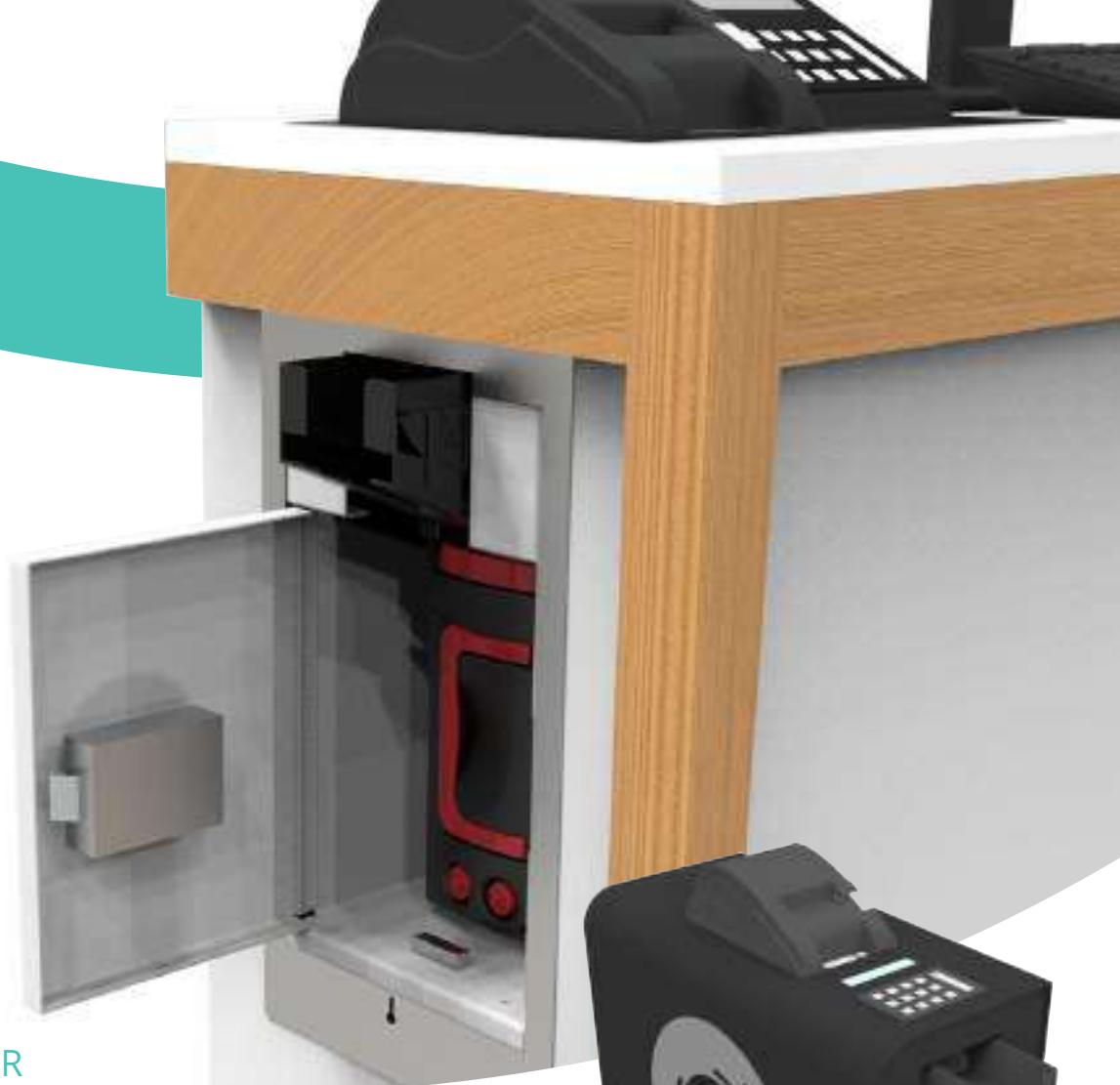
(Right: the standalone unit)