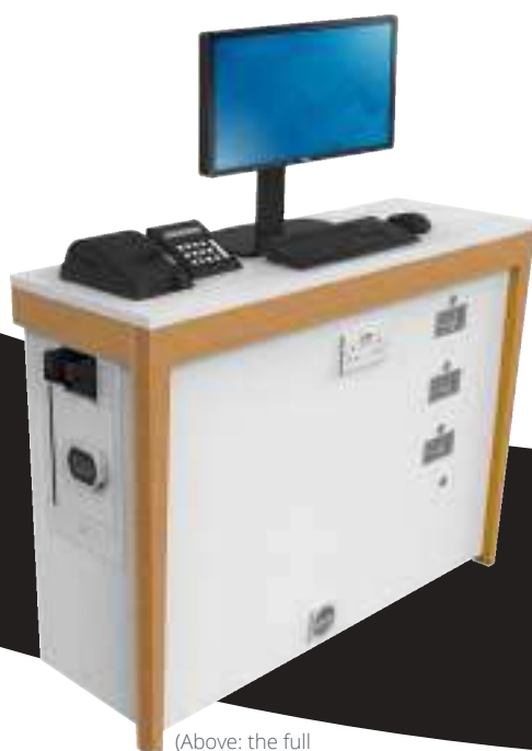
(Above: the full built-in unit)

This intelligent cash recycler offers an unrivalled note detection solution & protection against fraudulent notes. Designed to speed up transaction time and operator profitability, allowing for a reduction in back-office time required by staff, the Cash Recycler has exceptional note handling capabilities and is highly reliable, with a 99%+ first time acceptance of new and street grade notes for an efficient and streamlined cash counting process. Our Cash Recycler solution is regarded as the best in its class largely due to the efficiency of its performance in addition to the robust design and easy-to-use functions.