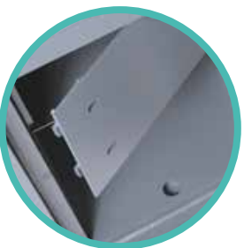
Lockable Deposit Compartments