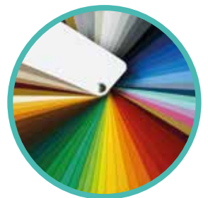
Bespoke colour options *Full range of RAL colours available